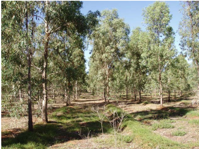
Six year old Eucalyptus plantation on the Liverpool Plains, NSW. From EMR Project Summaries, Monthly Archives, Sept 2011 Published as part of the journal Ecological Management & Restoration