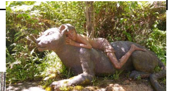
Sculpture from Bruno's Sculpture Garden in Marysville (permission not yet acquired)

See Forest Tourism in the Rubicon for photographs and maps showing the potential of these initiatives for encouraging visitors to the Rubicon.